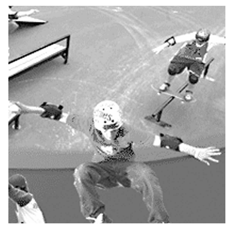
The proposed new skate board park at Municipal Harbor will provide a safe haven for enthusiasts.

The Borough has pursued a number of State and County funded grant programs in order to provide more recre-