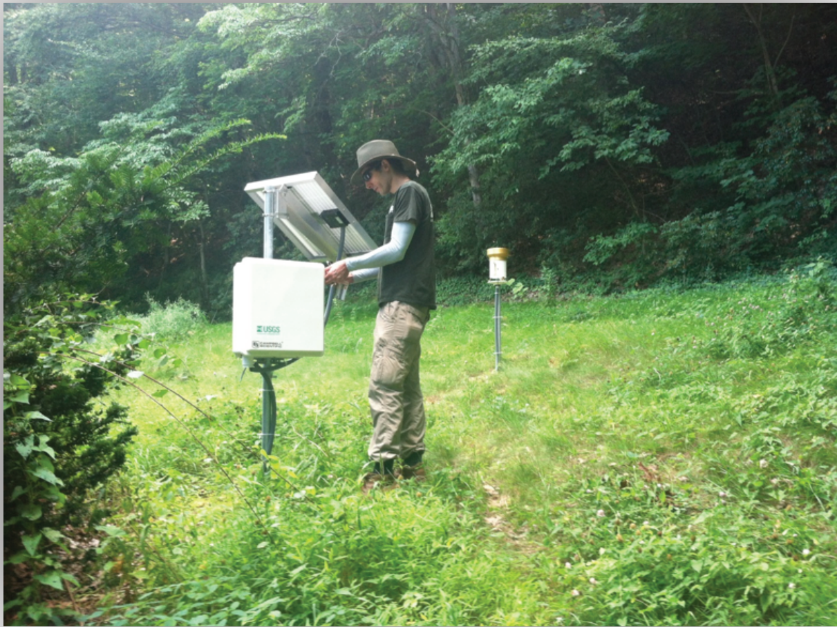
Figure 3. Photograph of a U.S. Geological Survey hydrologist downloading data near the open area rain gage at Mount Mitchell Scenic Overlook, New Jersey.

a datalogger. Site visits are routinely made to download data, perform maintenance, and conduct visual inspections.