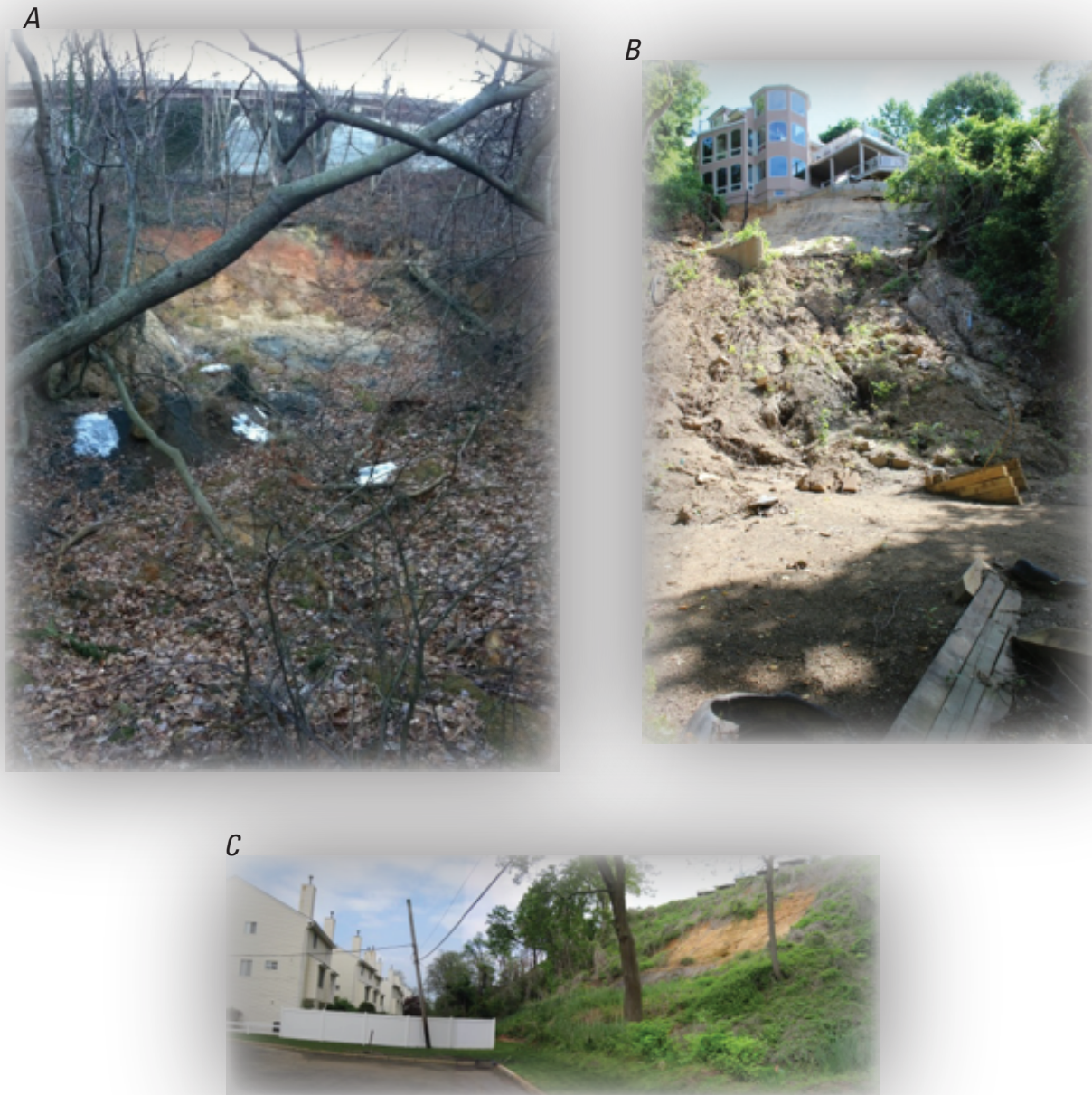
Figure 2. Photographs of three recent shallow landslides in the Atlantic Highlands area, New Jersey: A , May 2012 landslide and location of Ocean Boulevard Bridge monitoring site, B , April 2014 landslide, and C , one of three landslides in the Borough of Highlands that occurred during Tropical Storm Irene in August 2011.

sustained and intense rainfall associated with spring nor'easters and late summer–fall tropical cyclones. However, the critical relation between rainfall, soil-moisture conditions, and landslide movement has not been fully defined. The U.S. Geological Survey (USGS) is currently monitoring hillslopes within the Atlantic Highlands area to better understand the hydrologic and meteorological conditions associated with shallow landslide initiation.